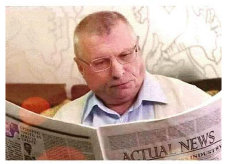
"I always read my wife's horoscope to see what kind of day I am going to have..."