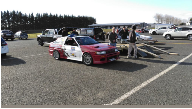
Some of the cars at Taupo,