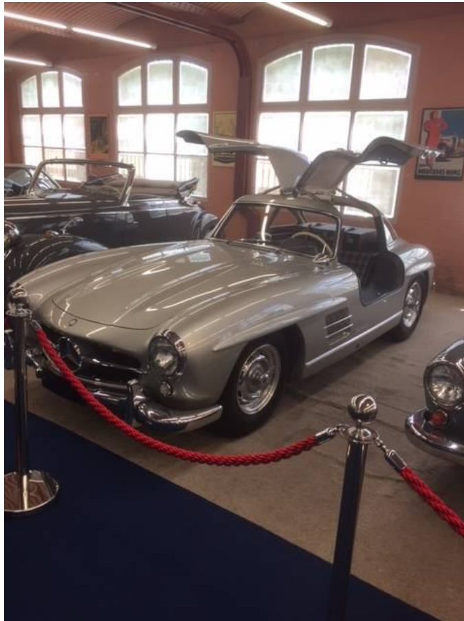
Mercedes Benz SL 350 Gull Wing