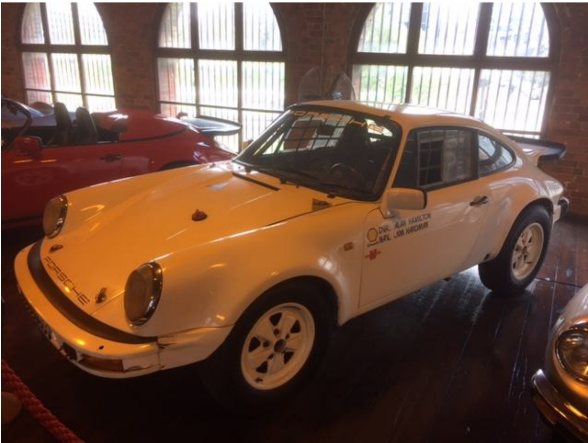
Porsche 959 test Mule