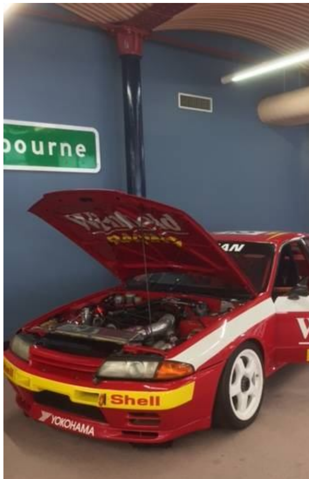
Group A Nissan Skyline GTR