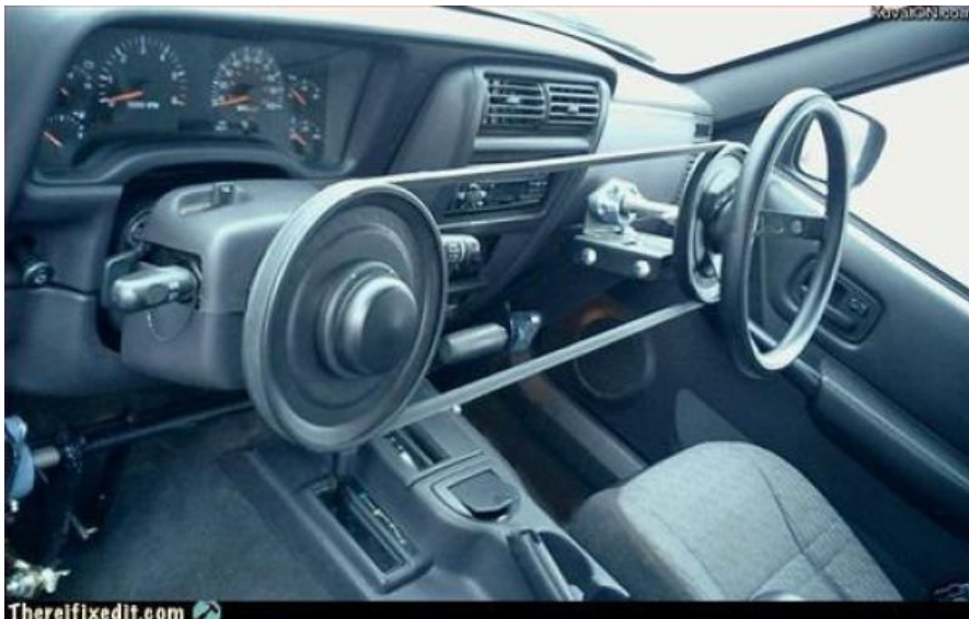
No left hand drive option? - I can fix that!

It was the end of the day when I parked my police van in front of the station. As I gathered my equipment, my K-9 partner, Jake, was barking, and I saw a little boy staring in at me. 'Is that a dog you got back there?' he asked.