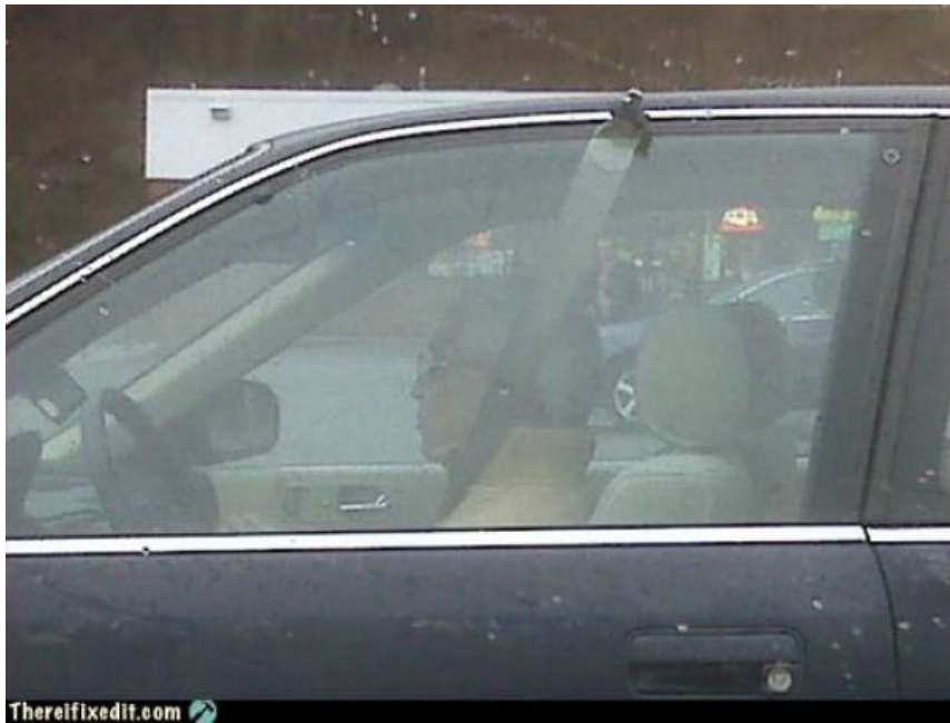
Seat belt broken? - I can fix that.....