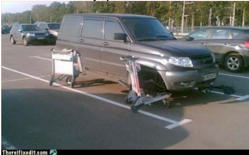
No axle stands? - I can fix that!