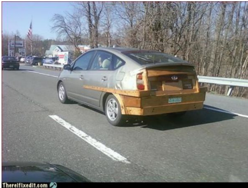
No woody option? I can fix that!