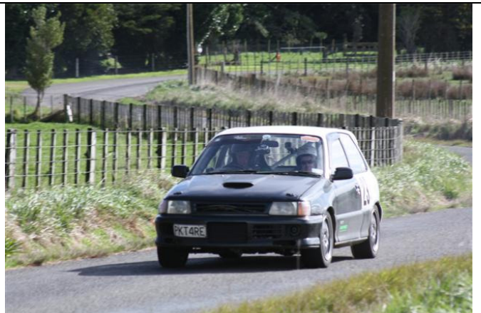
Webster - the winner!

A little boy got lost at the YMCA and found himself in the women's locker room. When he was spotted, the room burst into shrieks, with ladies grabbing towels and running for cover. The little boy watched in amazement and then asked, 'What's the matter, haven't you ever seen a little boy before?'