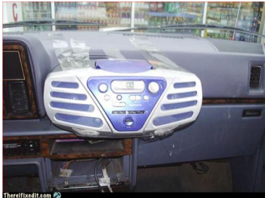
Stereo broken? I can fix that....