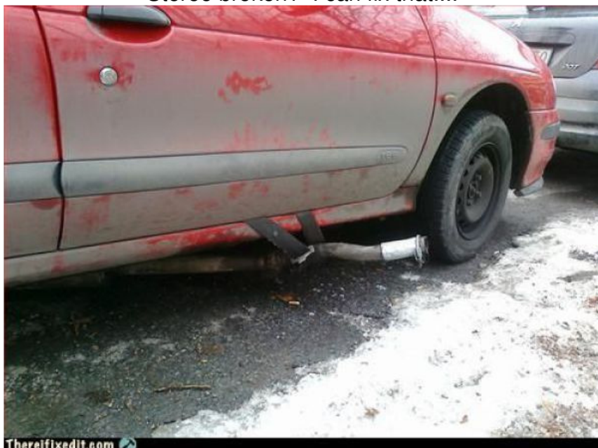
Exhaust Broken? - I can fix that!