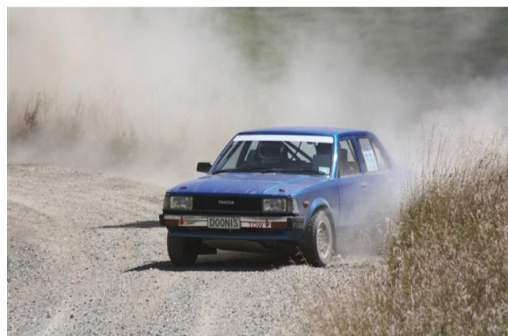
Brendon returning from the wild!