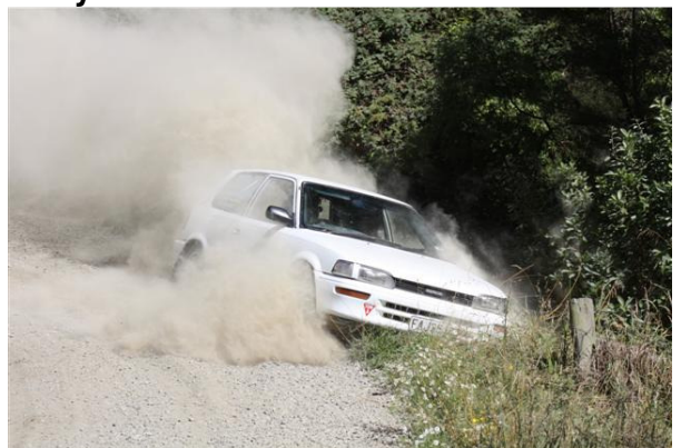
Bad Note Leon?