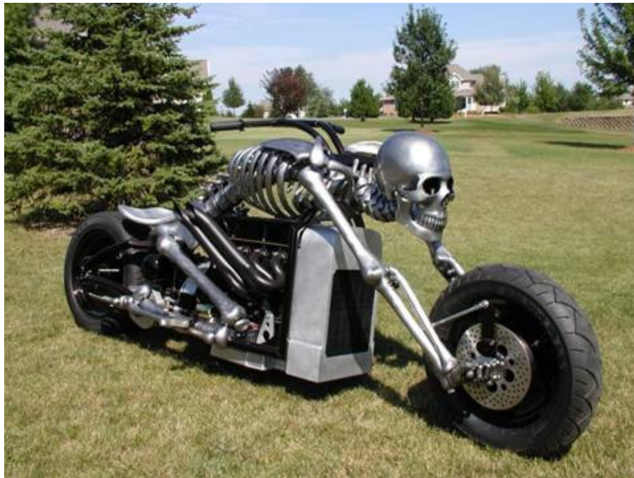
This guy doesn't need his tuxedo any more!

FYI "Smash Palace", movie night booked June 27th 7pm, MotorSport House.