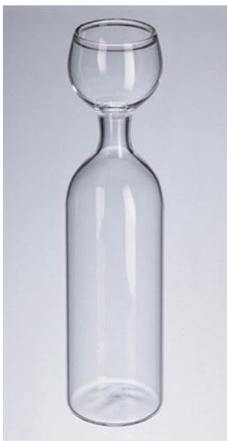
A perfect wine glass!